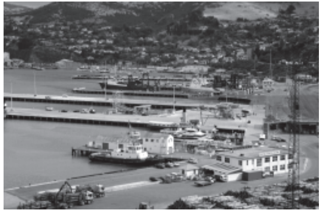
The Lyttelton Port Company facilities