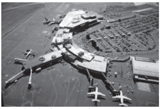
Christchurch International Airport Company terminal facilities from the air