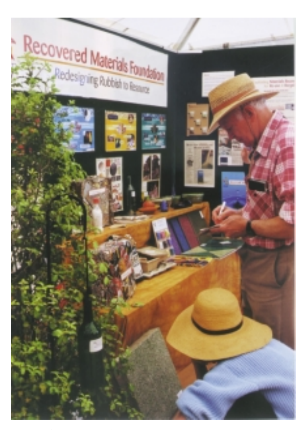
One of the many displays the RMF organises to show the use of "recovered materials"