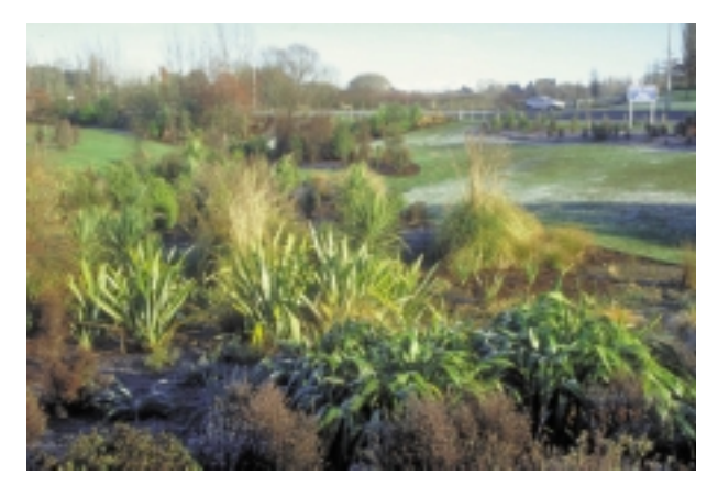
Waterway restoration project - Styx Mill Road/Regents Park